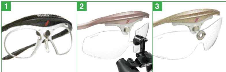
1: Hogies prescription model. 2: Magnetic modular attachment system. 3: Distortion-free safety shield.

PeriOptix loupes are also available in lightweight Performance Plus™ silver and black titanium frames.